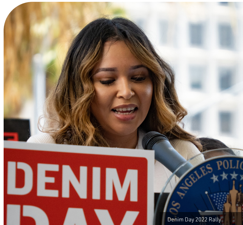
Denim Day 2022 Rally