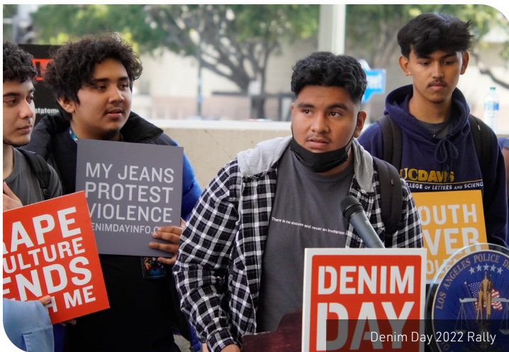
Denim Day 2022 Rally