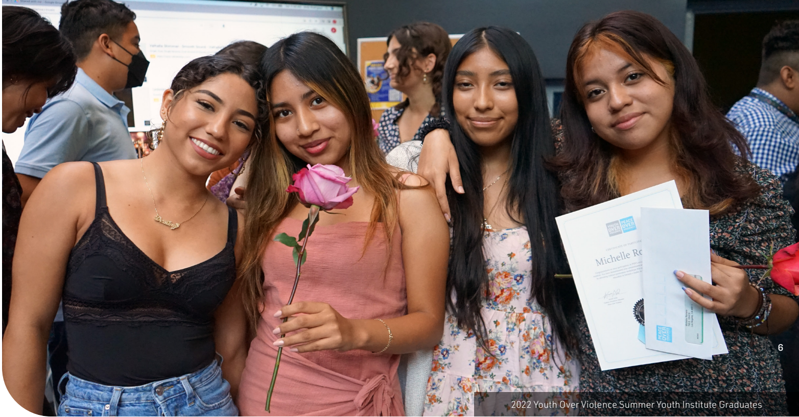
2022 Youth Over Violence Summer Youth Institute Graduates