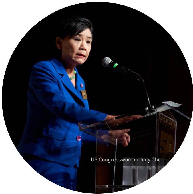
US Congresswoman Judy Chu