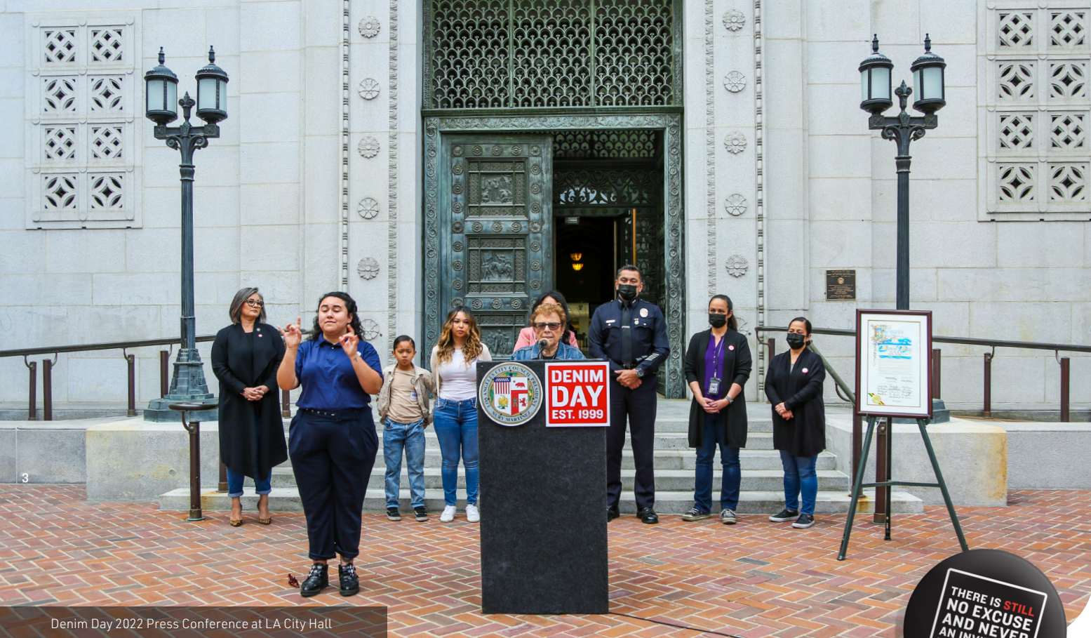
Denim Day 2022 Press Conference at LA City Hall